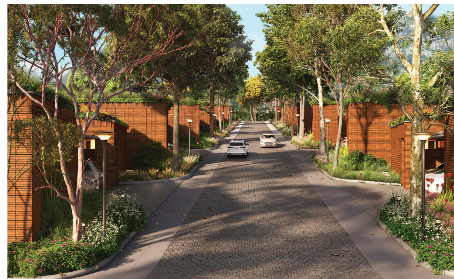
Visualisation of the villa street at Over the Rainbow