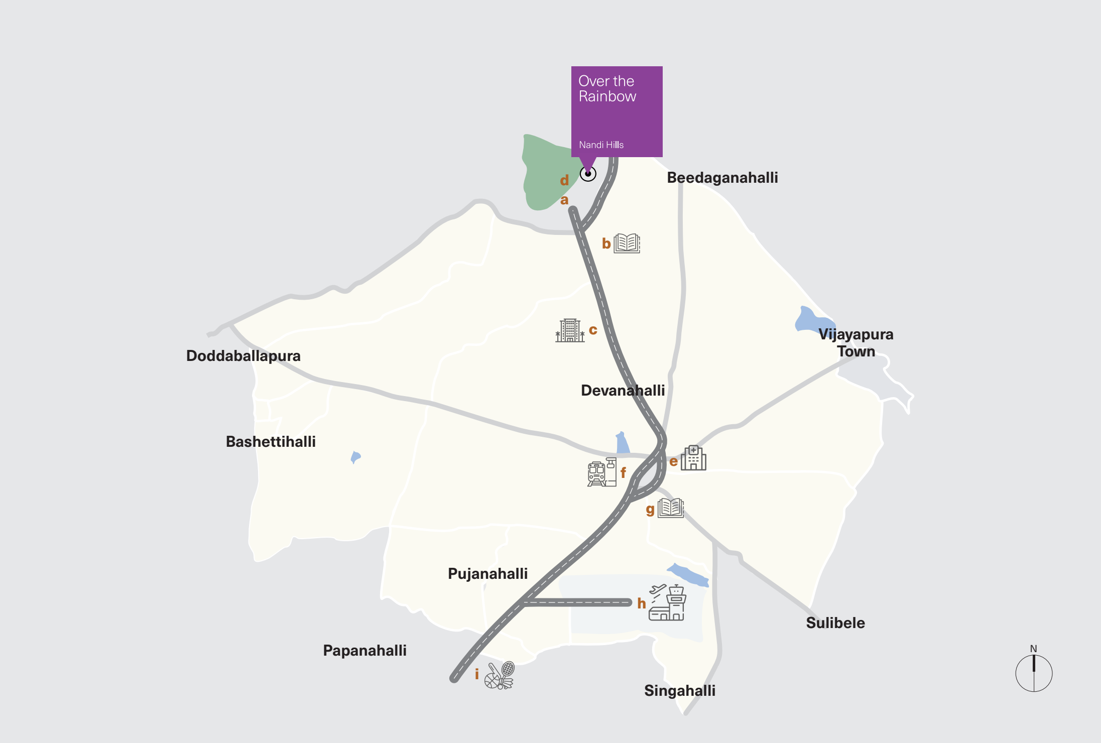
Over the Rainbow - Location map