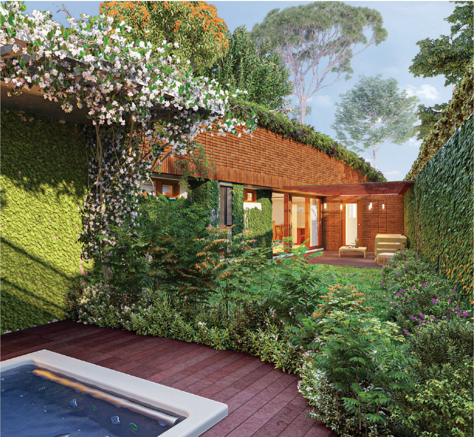
Visualisation of V25 villa from Garden 1