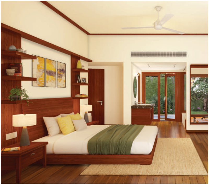
The project includes our signature earth-sheltered villas with 3 bedrooms.