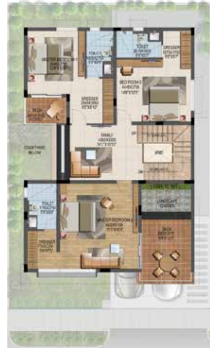
4 BHK Villa-Type2 (E)