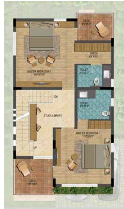
4 BHK Villa-Type1 (W)