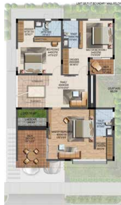
4 BHK Villa-Type2 (W)