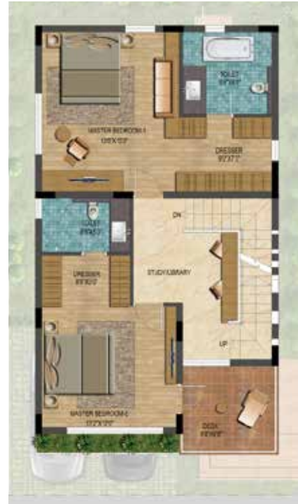
4 BHK Villa-Type1 (E)