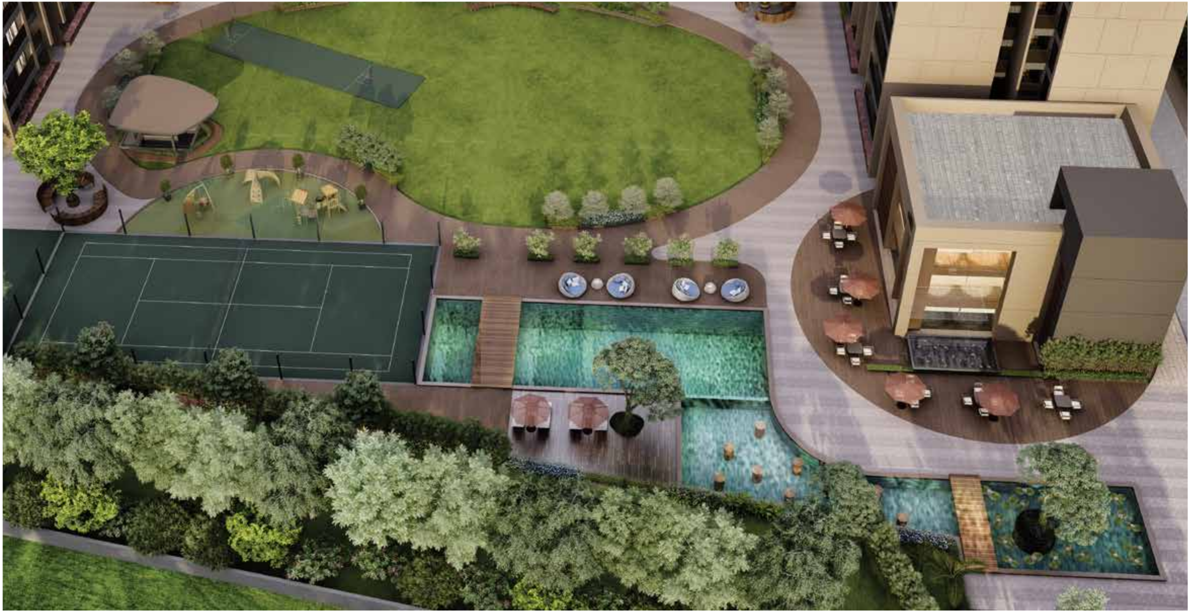
sports features integrated into the central landscape