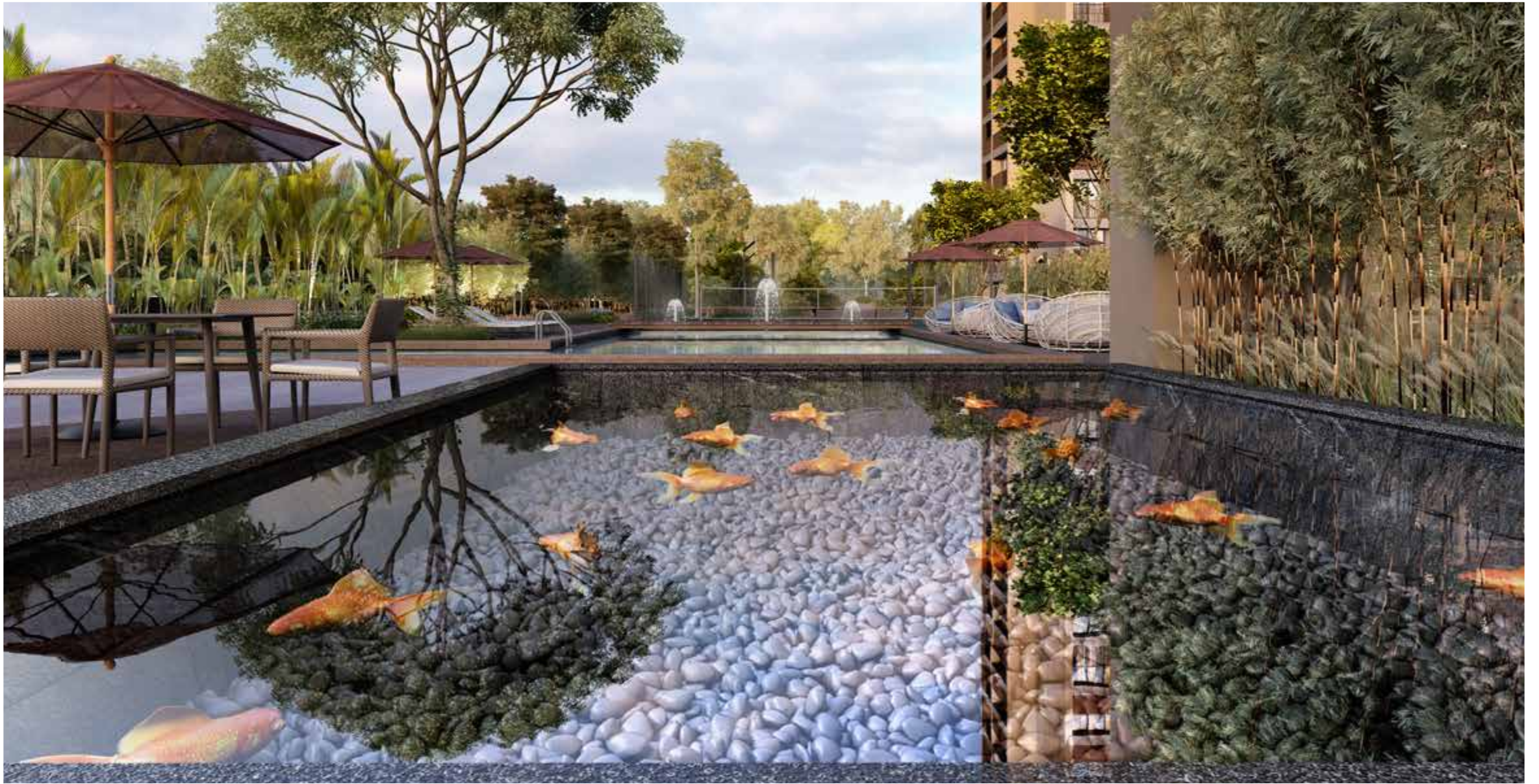
Multiple water features incorporated into design