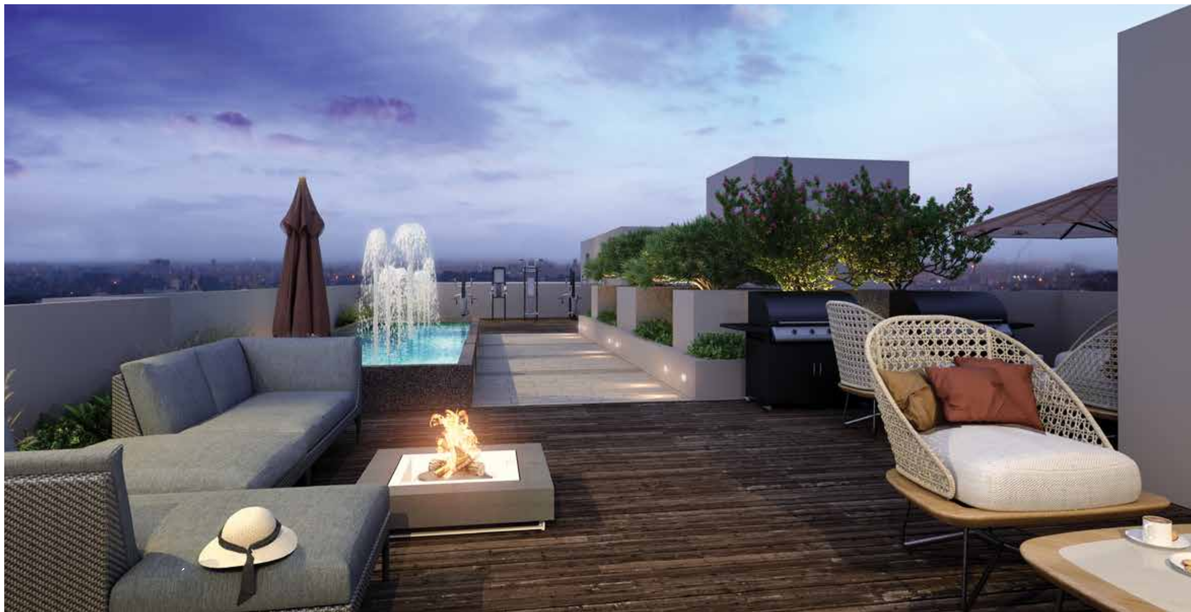
Aqua cafe and Gym on the terrace