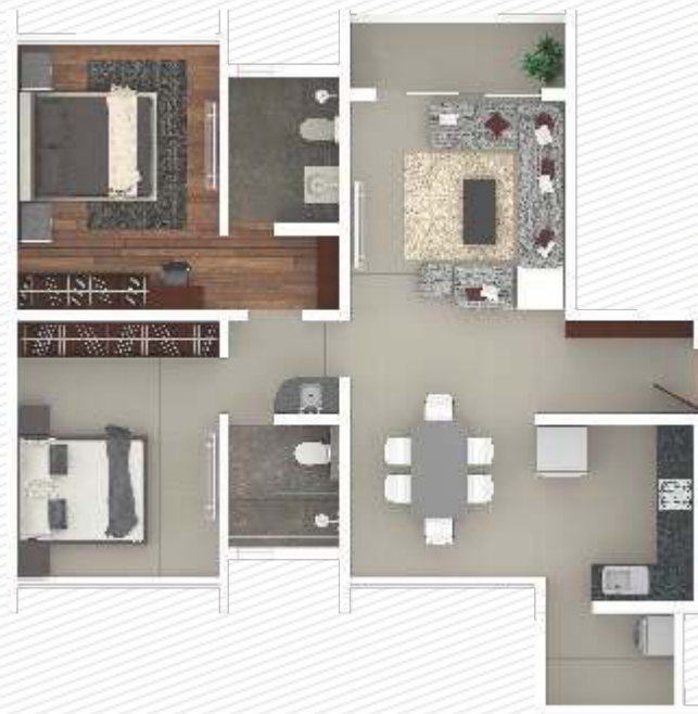
2 BHK Type 1