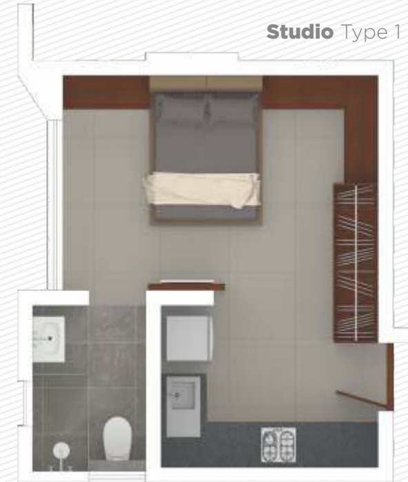
Studio Type 1