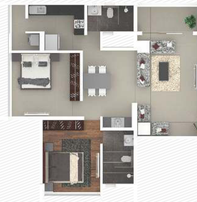
2 BHK Type 2