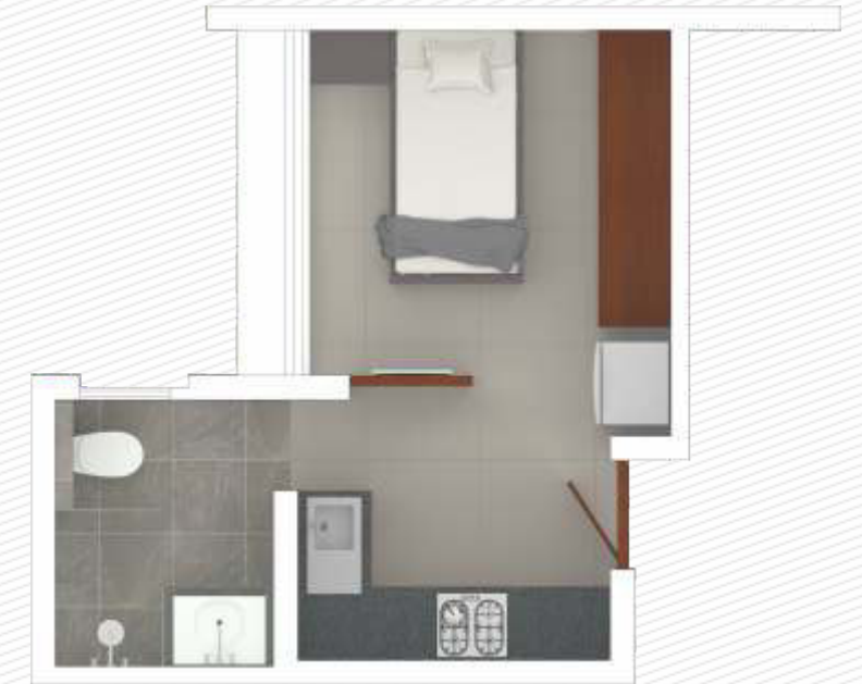
Studio Type 2