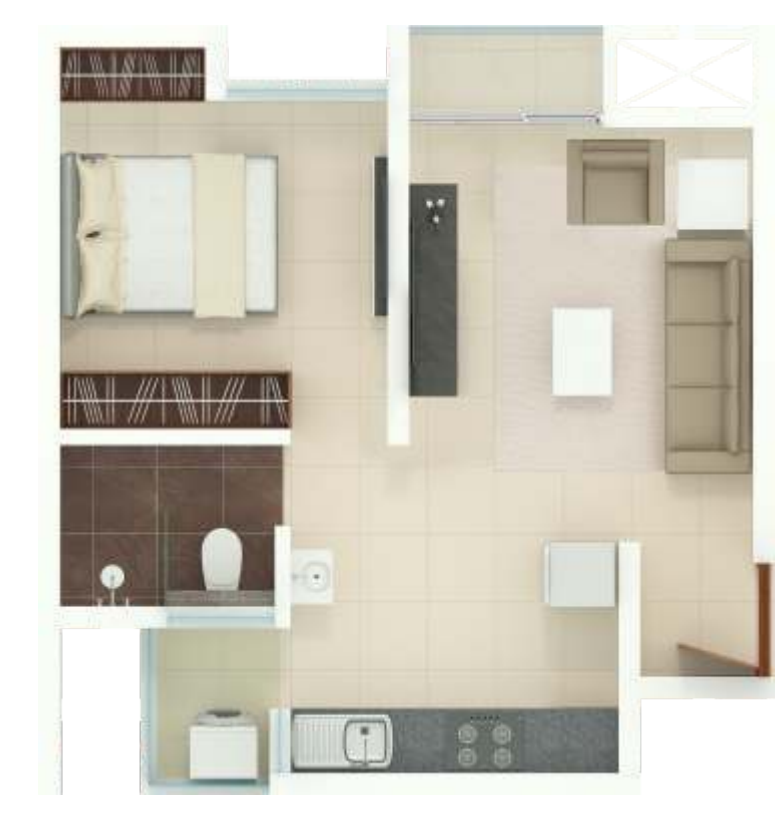
Typical 1 BHK