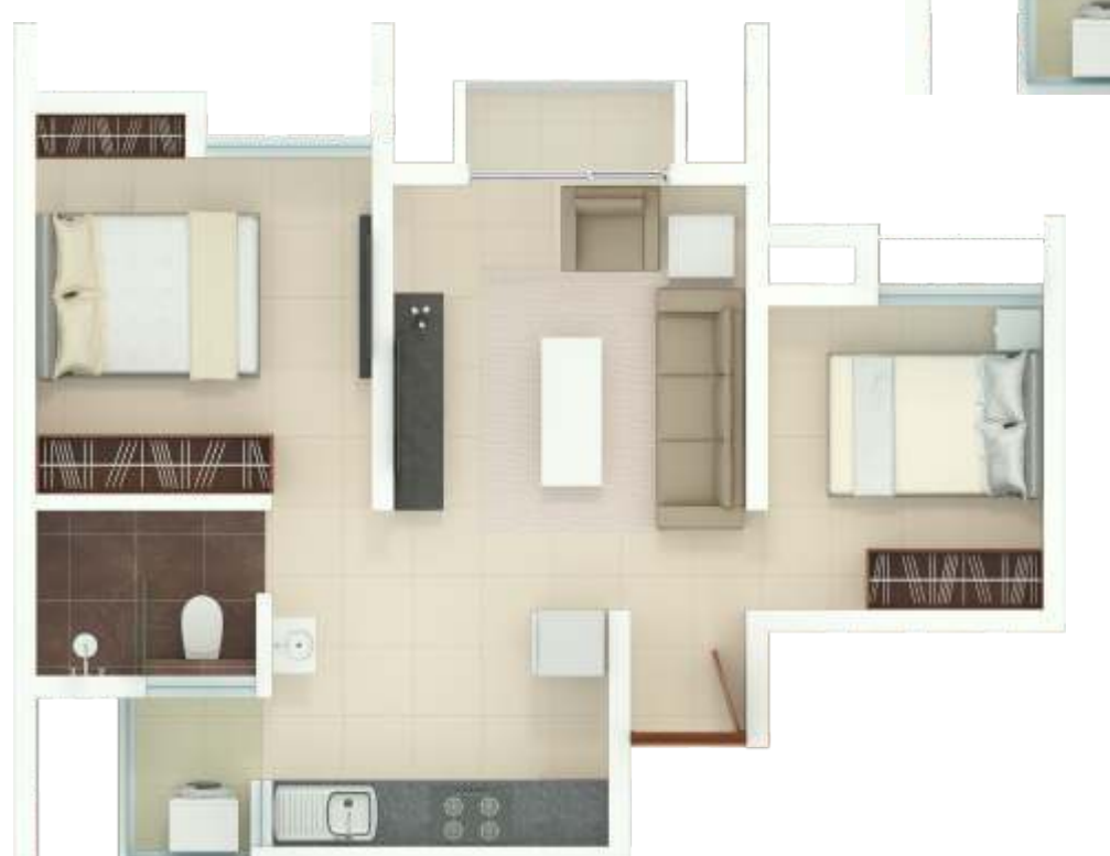
Typical 1.5 BHK