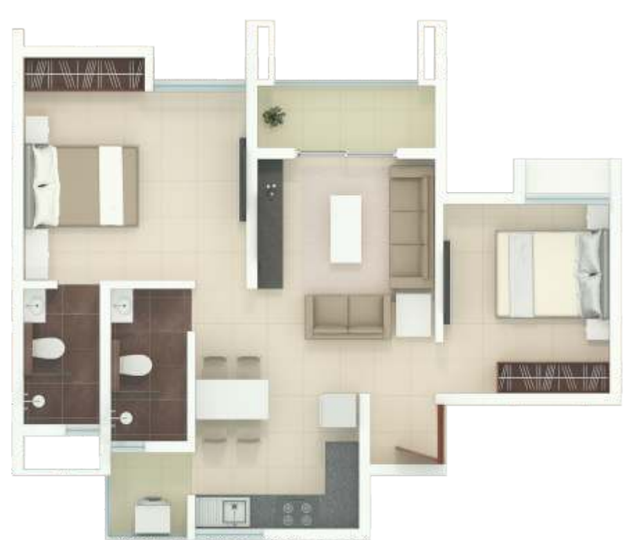
Typical 2 BHK Type -1