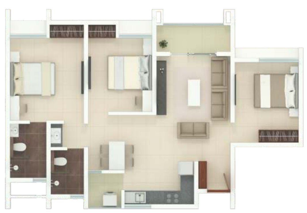
Typical 2.5 BHK